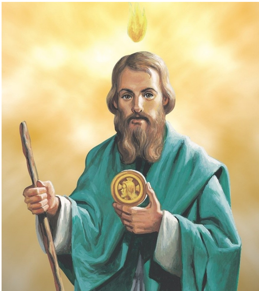
St. Jude Thaddeus (Mar Laba)